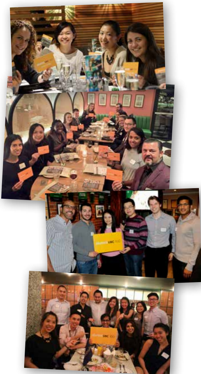
Nearly 1,000 alumni have attended a 100 Dinners event.

The 100 Dinners program came to a close on May 4 with the conclusion of alumni UBC 100 . The final two months of this initiative were extremely busy with more than a dozen dinners taking place around the world, including gatherings in Vancouver, Prince George, Calgary, Toronto, Halifax, Boston, Oslo, Zurich, Singapore, and Australia. Over the course of alumni UBC 100 , nearly 1,000 alumni attended a 100 Dinners gathering. Given the success of this initiative, alumni UBC plans to rebrand and relaunch the 100 Dinners program in the fall.