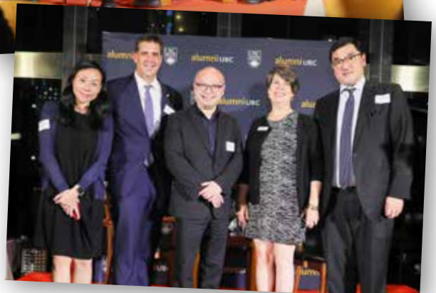
Alumni in Hong Kong learned about healthy aging.