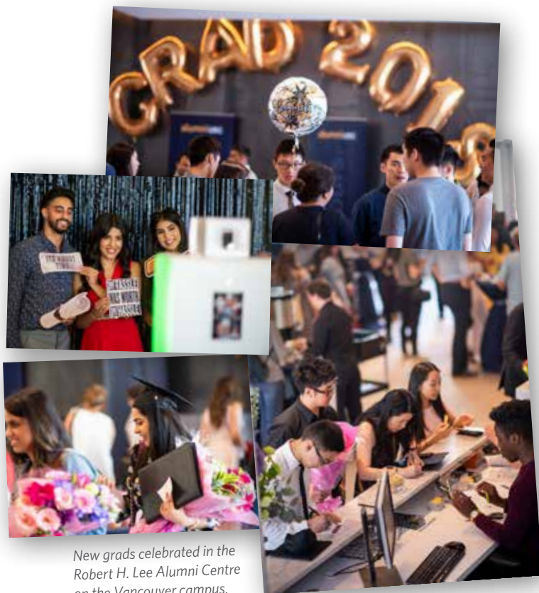
New grads celebrated in the Robert H. Lee Alumni Centre on the Vancouver campus.

A few days later, on June 7 and 8, it was the turn of UBC's Okanagan campus, where more than 1,700 students received their degrees and were enthusiastically welcomed into the alumni UBC family. Staff and alumni volunteers helped to make the graduation experience memorable by hosting new alumni at the alumni UBC welcome tent, taking photos to mark the occasion, distributing A-Cards, and informing them about the many benefits and professional resources available through alumni UBC . Graduates and their families were encouraged to return in October for the Okanagan campus's inaugural Homecoming festivities.