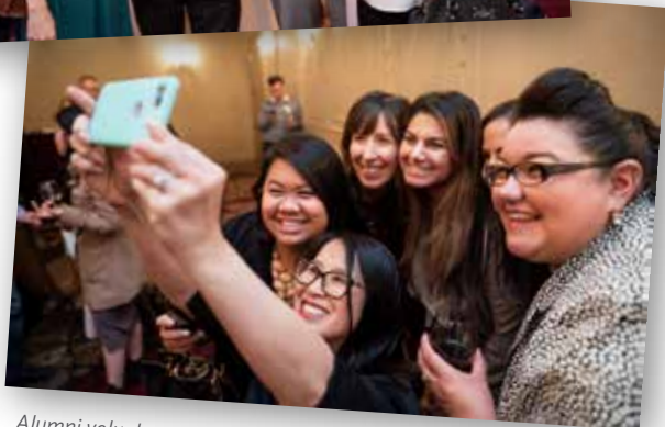
Alumni volunteers were thanked at Terminal City Club in April.