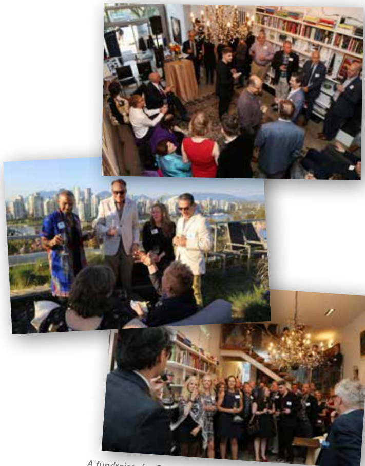
A fundraiser for CampOUT raised $70K for the LGBTQ2+ youth leadership program.