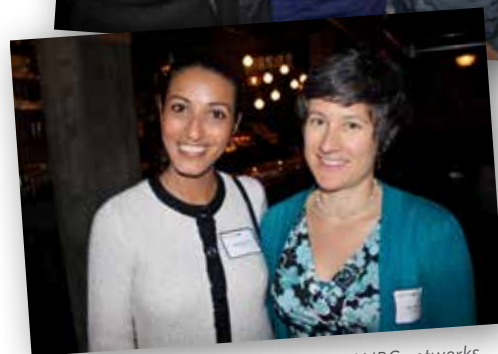
Alumni in Halifax expanded their local UBC networks.