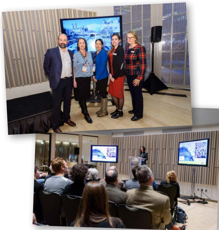
UBC experts gave presentations on their latest research in Ottawa this February