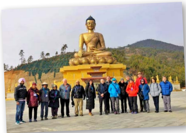
The 169-ft tall Buddha Dordenma statue.