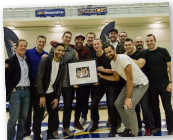
Basketball grads renewed old friendships in Kelowna

On January 19, Men's Heat Basketball alumni celebrated their 10-year anniversary in Kelowna with a full day of activities. From catching a home game of basketball to bowling at a local pub, there was plenty of catching up and laughter as new memories were made.