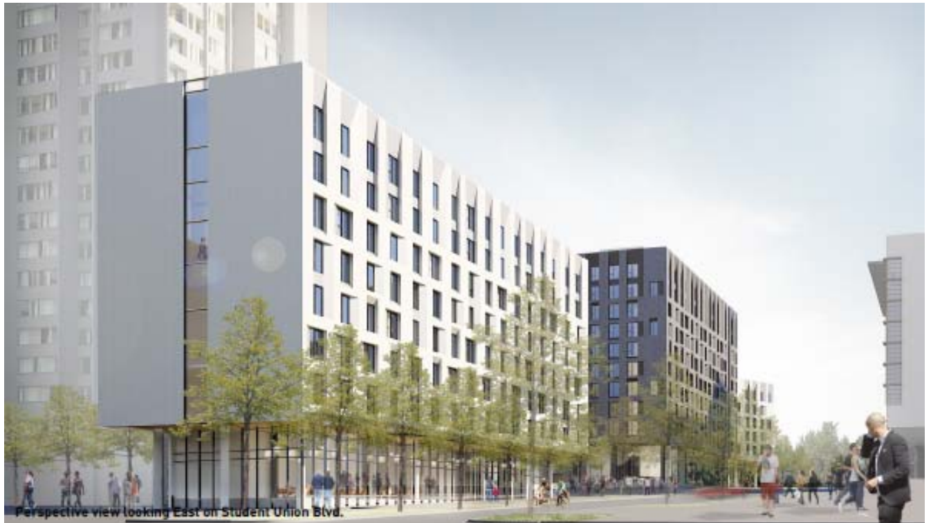
(Perspective view looking East on Student Union Blvd)

(Colours, materials and façade details to be refined)