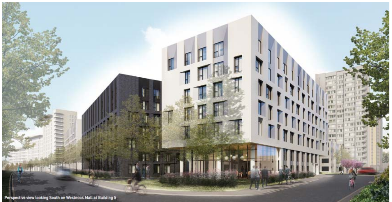
(Perspective view looking South on Westbrook Mall)