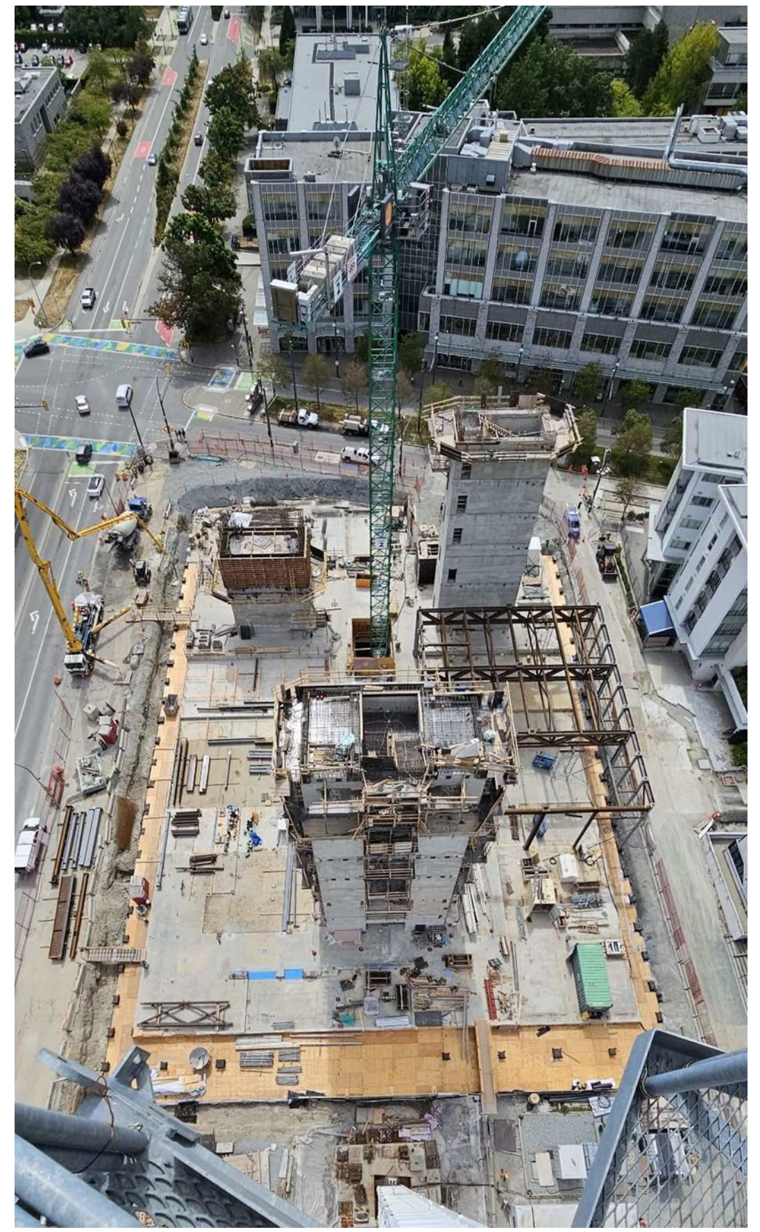
View from above showing elevator cores